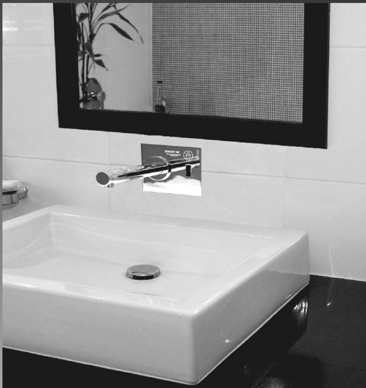
Spout shown is for illustration only

Ideal for commercial and public Bathroom installations.